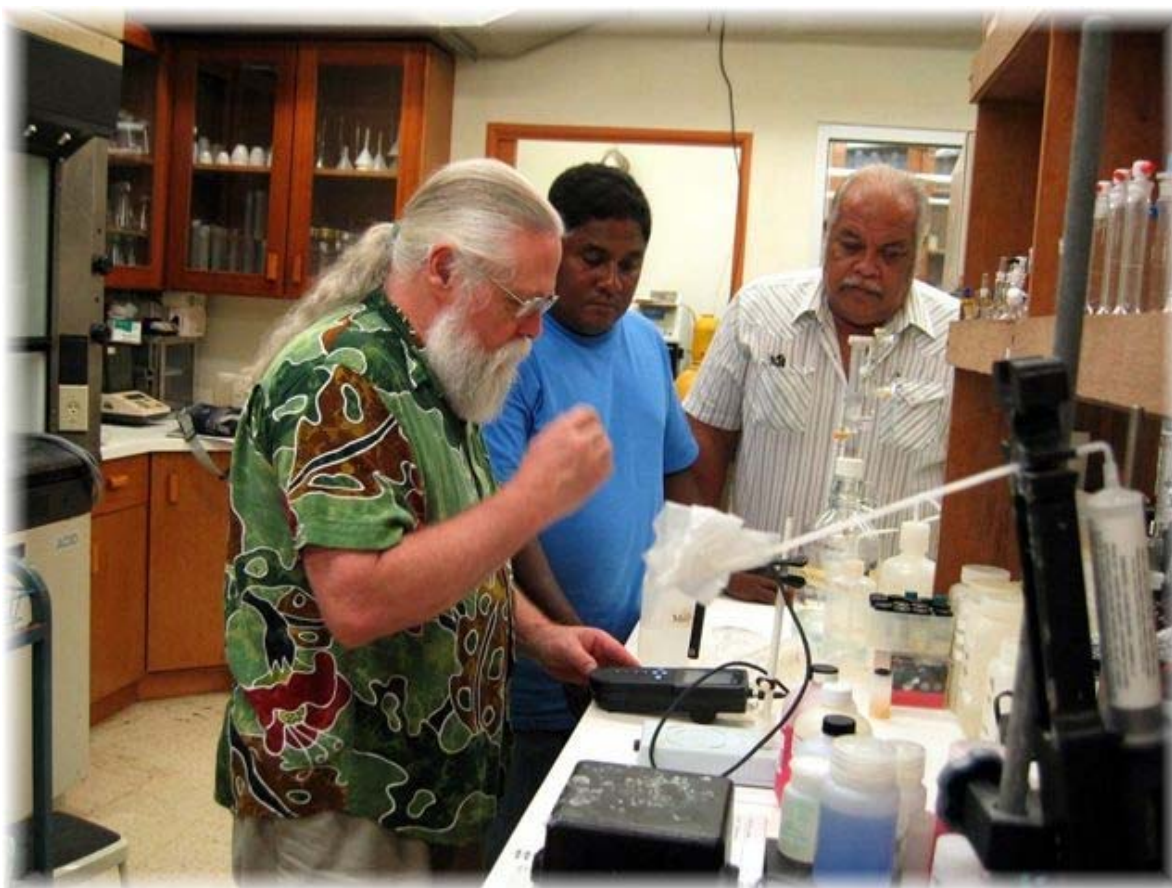
Figure 3 In house training at Water and Environmental Research Institute

Of the 78 samples collected from wells and distribution lines of GTWS, 25 tests were positive with sources that included a smaller water tank connected to the distribution system, storage tank, and a number of sites connected to the main distribution lines.